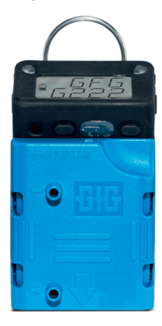
Micro 5 with Calibration Cap. Alternatively available the Smart Cap with infrared interface and mini-USB plug.

If you want to read out the content of the data logger, you will need the Smart Cap, a USB connection cable and the Config Software for the G222 series instead.