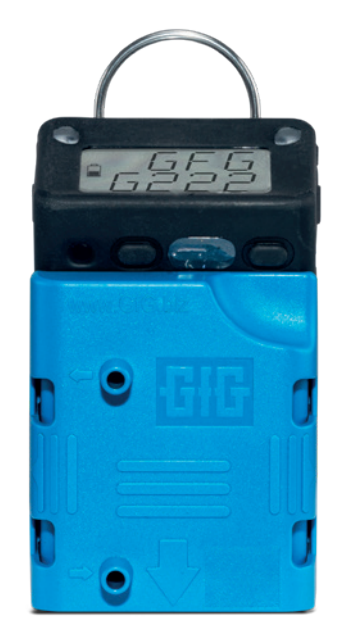
Micro 5 with Calibration Cap. Alternatively available the Smart Cap with infrared interface and mini-USB plug.

If you want to read out the content of the data logger, you will need the Smart Cap, a USB connection cable and the Config Software for the G222 series instead.