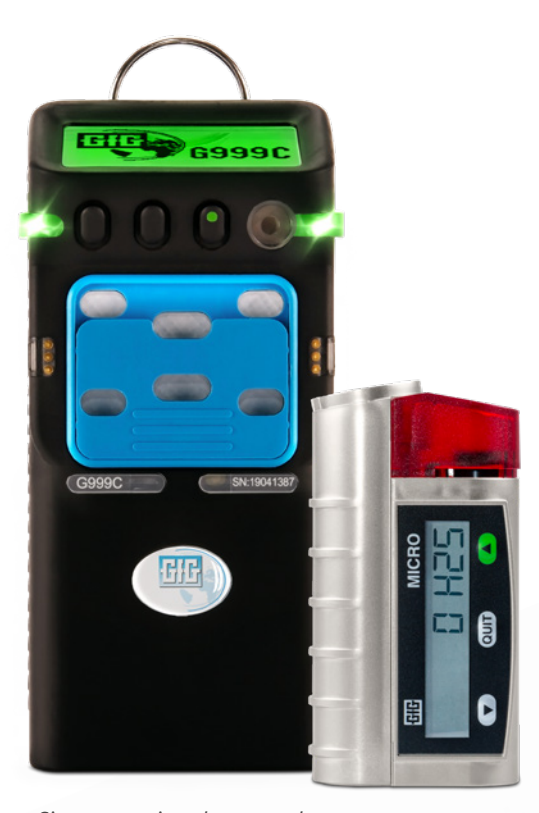
Size comparison between the Polytector G999 multi-gas detector and the Micro IV