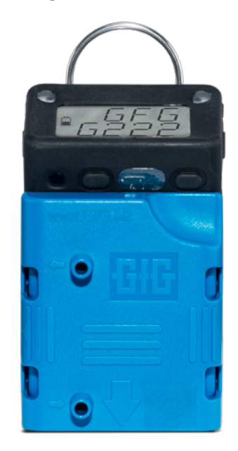
Micro 5 with Calibration Cap. Alternatively available the Smart Cap with infrared interface and mini-USB plug.

If you want to read out the content of the data logger, you will need the Smart Cap, a USB connection cable and the Config Software for the G222 series instead.