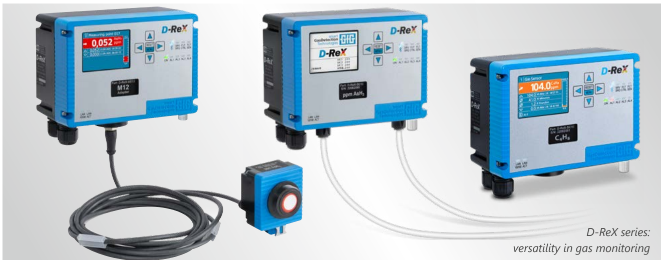
D-ReX series: versatility in gas monitoring

Electrochemical, pellistor, infrared, and PID sensors are available for detecting more than 60 different gases.