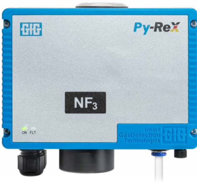
Pyrolyzer add-on for the D-ReX PoS

Do you need to monitor fluorine compounds in your application?