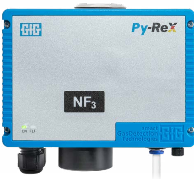
Pyrolyzer add-on for the D-ReX PoS

Do you need to monitor fluorine compounds in your application?