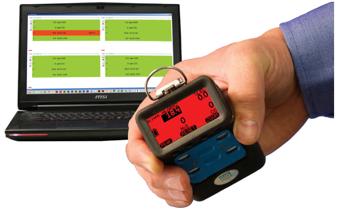
Figure 3: The RF transceiver and visual software can be installed on a laptop, tablet or personal computer. The transceiver plugs into any available USB port. The monitoring information is displayed directly on the computer screen or LCD. Transmitted information includes readings, gas alarms and "man down" alarms in the event that a worker falls or stops moving.

Spread-spectrum, frequency hopping radio transmitters send a short, high-speed stream of digital packets of information at one frequency, then "hop" to another frequency to transmit the next stream of data packets. Part of the information encoded in the string of packets is the frequency where the receiver (or transceiver) should look for the next string. Because of heavy redundancies in the information transmitted in the digital strings, as well as multiple fallback frequencies encoded in the string in case of a failure to receive the next stream of information at the expected frequency, it is possible to maintain seamless communication between the base controller and remotely located detectors, even when there is significant loss of individual strings of information.