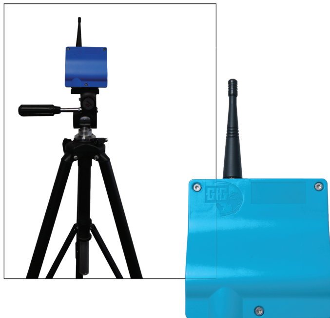
Figure 4: Repeater units can be used to acquire and retransmit the RF signal to get around corners or intervening obstructions. Adding multiple repeaters can be used to extend the transmission distance to as many miles as needed.

Flexibility in the display of readings and alarm state information is also very important. The primary location for the display of the monitored results might be on the supervisor’s laptop, but the real-time monitoring information might also need to be redundantly displayed in the office of a third party rescue team.