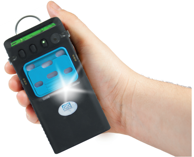
Figure 5: The G999 is a compact, one to six gas atmospheric monitor with internal motorized sample drawing pump and optional wireless communication. The powerful, built-in 868 MHz wireless RF modem has a transmission distance of up to 300 meters.

Wireless communication provides a particular benefit where, in the event of an emergency, rescue services are to be provided by a “third-party” provider. It goes beyond the scope of this article to debate the circumstances under which it is prudent to rely on rescuers who are not physically present at the site until after an emergency has occurred. The fact remains that many programs rely on exactly this approach to conducting a rescue. One thing is very clear, if this is the approach to conducting a rescue, the timeliness in sounding the alarm and / or activating the response team is crucial to the ability of the team to successfully respond to the incident.