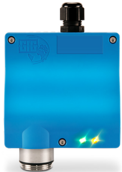
ZD22 D transmitter with one cable entry for analog connection

In combination with GfG's powerful controllers, both variants are the right choice for long-term oxygen monitoring.