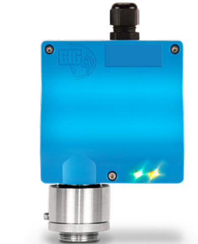
Analog version of the EC22 O with one cable entry

The compact housing for wall mounting is protected against splash water and dust (IP54). There are two status LEDs on the front of the EC22 O. The green one indicates operational readiness, the yellow one signals faults or special states.