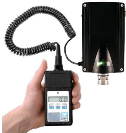
CC28 with RC2 remote control

The design is ATEX certified. With ignition protection types „d“ (flameproof enclosure) and „e“ (increased safety), safe use in Ex zone 1 is possible. In addition, the CC28 hardware complies with the European Functional Safety Standard DIN EN 61508-2: 2011 for many gases.