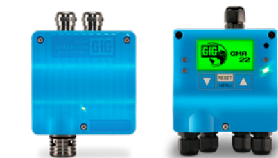
CC22 ex and GMA22-M controller