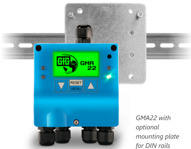
GMA22 with optional mounting plate for DIN rails

Even more flexibility results from the option to address not only the transmitters but also up to 4 additional relay modules of type GMA200-RT or GMA200-RTD via the digital RS485 interface.