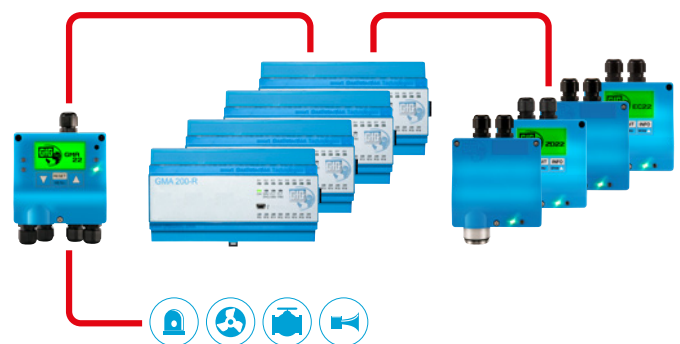
GMA22 maximum configuration

ACDC (Analog Carrier for Digital Communication) is a patented technology of GfG. It allows an analog transmitter to communicate with a controller via a 4-20 mA line in the same way that a digital transmitter communicates via a bus connection. This allows, for example, for remote calibration of an analog transmitter. However, the prerequisite is that both devices are ACDC-capable.