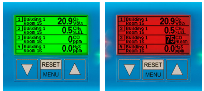
Measured value overview in normal or alarm state

The current measured values of all transmitters are continuously displayed on the 2.2" LCD. The operating status is indicated by the status LEDs. In normal operation, only the green LED is lit. A yellow LED indicates malfunctions or service work. In the event of an alarm, the background color of the display changes from green to red and only the measured values of the measuring points at which the limit values were exceeded or fallen below are displayed. Red LEDs indicate the alarm level. In addition, an acoustic warning signal sounds.