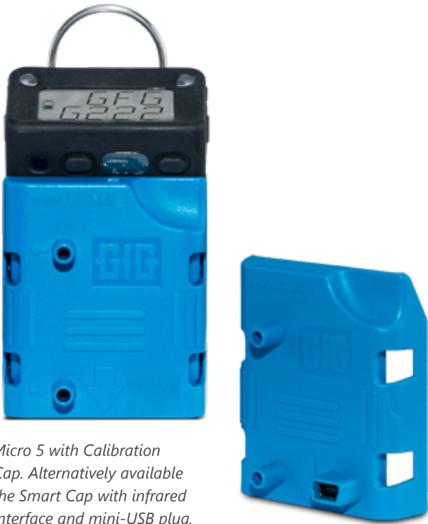
Micro 5 with Calibration Cap. Alternatively available the Smart Cap with infrared interface and mini-USB plug.

If you want to read out the content of the data logger, you will need the Smart Cap, a USB connection cable and the Config Software for the G222 series instead.