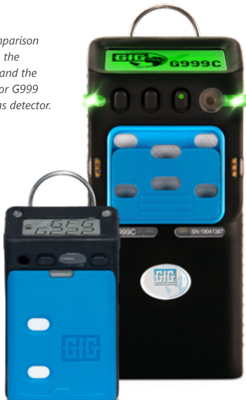
Size comparison between the Micro 5 and the Polytector G999 multi-gas detector.

« Certified for use in underground operations. »